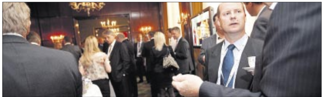
GRAND HOTEL: Delegates, panellists and speakers gather in the venerable surroundings.

The talks are produced by TradeWinds's sister company, NHST Events.